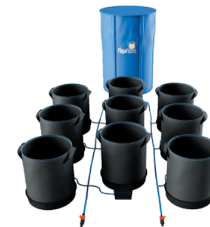
9Pot XXL 13 (13 gal pot - excl. adaptive collar)