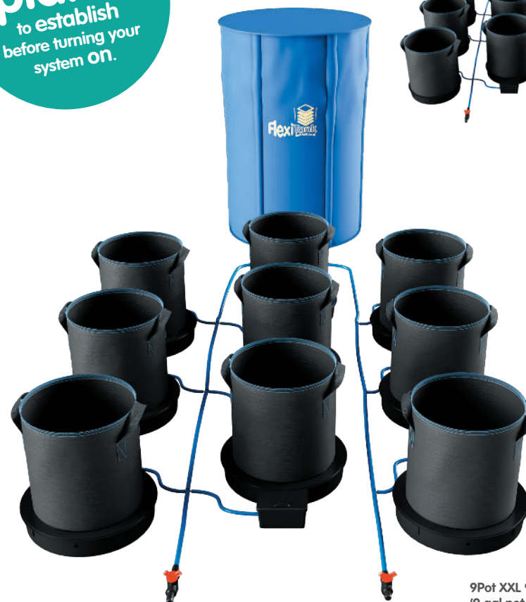
9Pot XXL 9 (9 gal pot - incl. adaptive collar)