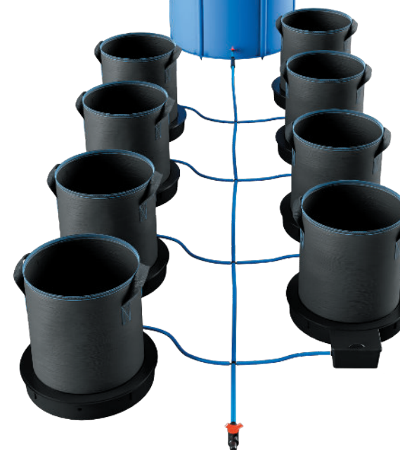
8Pot XXL 9 (9 gal pot - incl. adaptive collar)