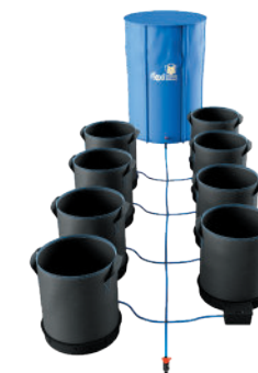
8Pot XXL 13 (13 gal pot - excl. adaptive collar)