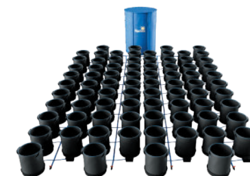
80Pot XXL 13 (13 gal pot - excl. adaptive collar)