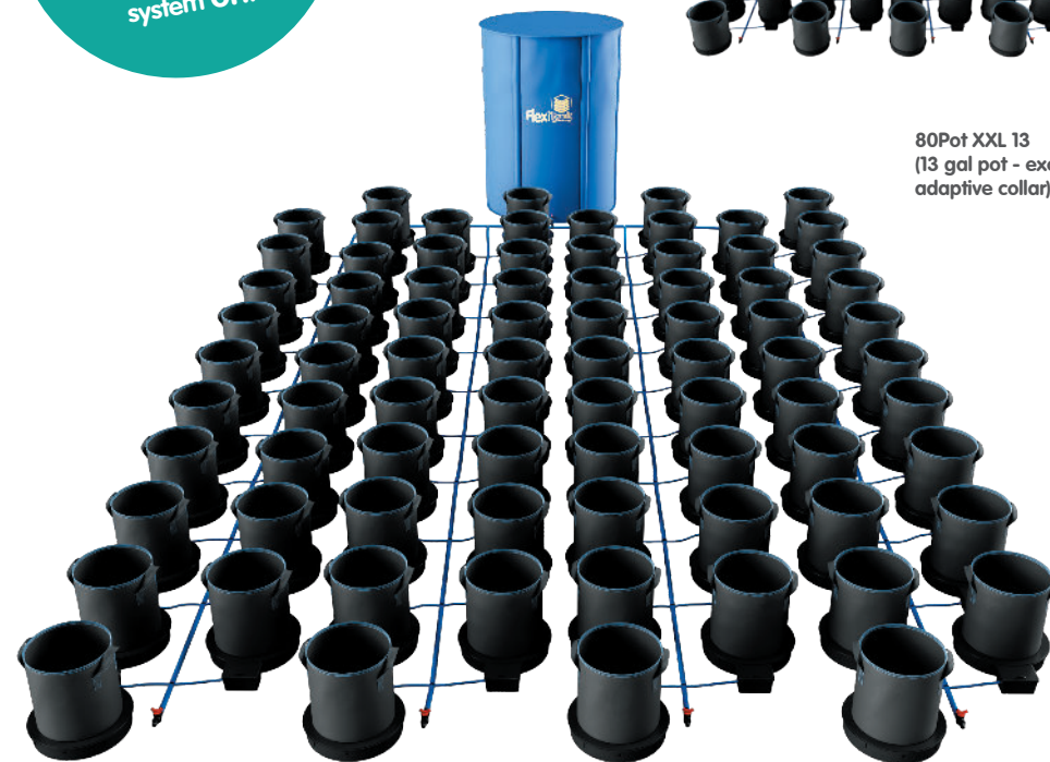
80Pot XXL 13 (13 gal pot - incl. adaptive collar)