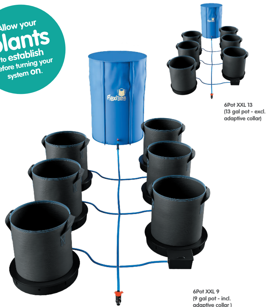
6Pot XXL 13 (13 gal pot - excl. adaptive collar)