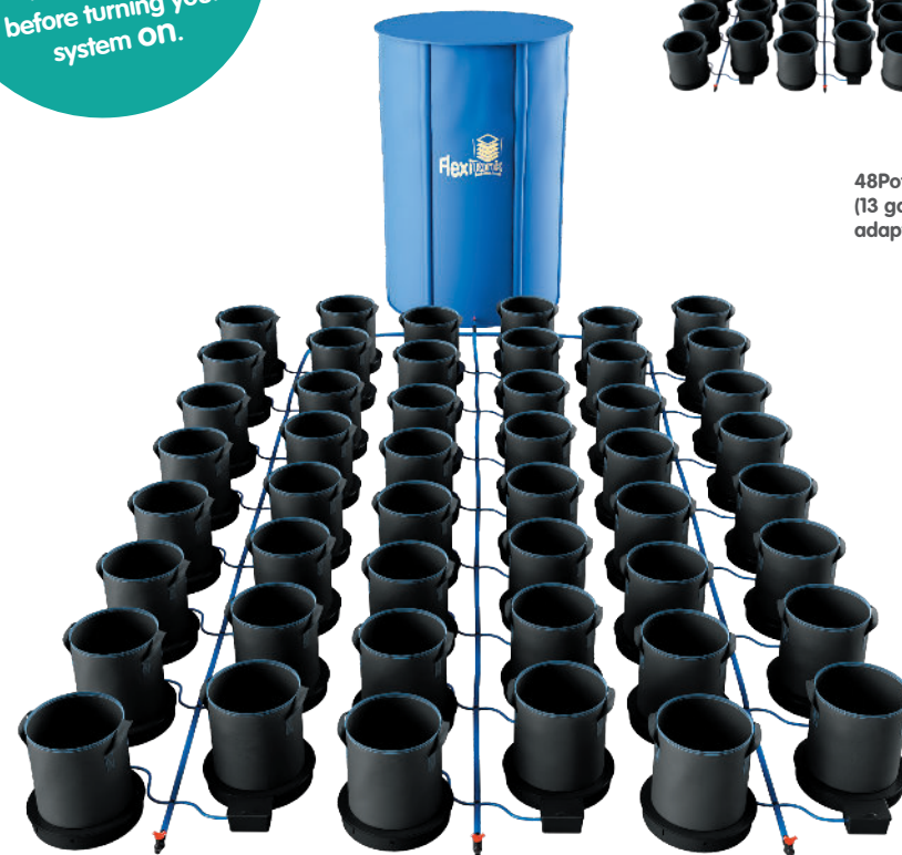
48Pot XXL 9 (9 gal pot - incl. adaptive collar)