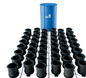
48Pot XXL 13 (13 gal pot - excl. adaptive collar)