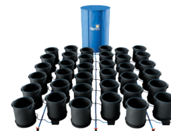
36Pot XXL 13 (13 gal pot - excl. adaptive collar)