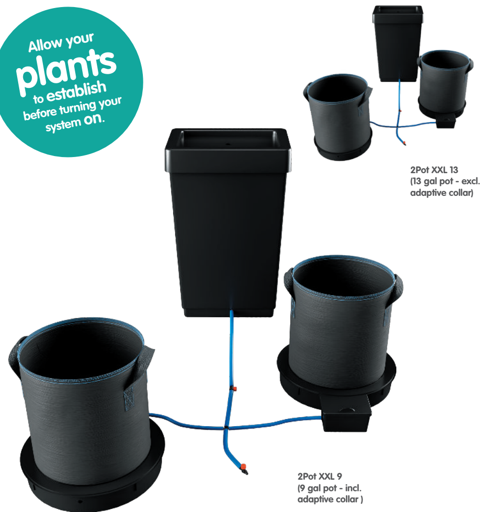
2Pot XXL 13 (13 gal pot - excl. adaptive collar)