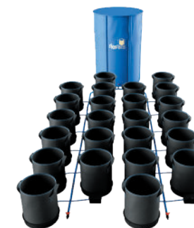
24Pot XXL 13 (13 gal pot - excl. adaptive collar)