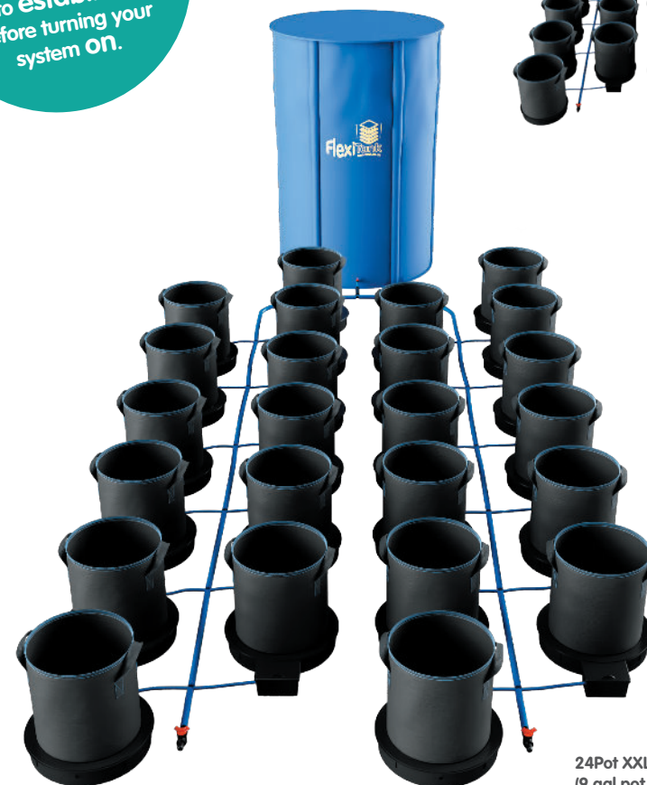
24Pot XXL 9 (9 gal pot - incl. adaptive collar)