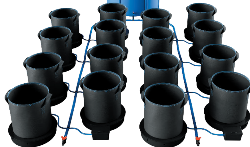
16Pot XXL 9 (9 gal pot - incl. adaptive collar)