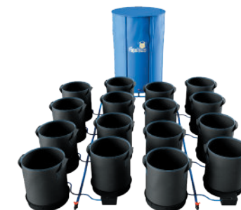
16Pot XXL 13 (13 gal pot - excl. adaptive collar)