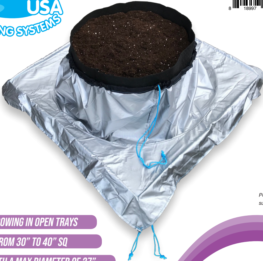
Pot, tray and substrate not incl.